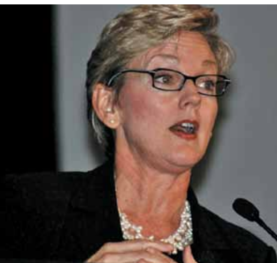
Jennifer Granholm, former governor of Michigan, addresses APHA Midyear Meeting attendees.

I N A YEAR WHEN FEDERAL HEALTH reform moved forward and a tight economy put continued pressure on the nation, APHA succeeded on many fronts in protecting and promoting public health while strengthening the Association and positioning it for the future.