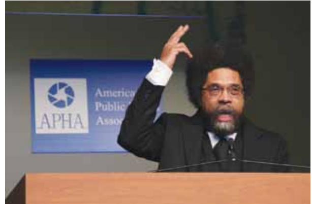
Cornel West helps kick off APHA's Annual Meeting in Denver.

In a continued commitment to publication excellence, APHA published five new books this year, including titles on healthy homes, child care and megacities. Books published from 2010 and forward have been converted into an e-book format. Also, the newly released Mobile + Web version of the Control of Communicable Diseases Manual®, a public health standard first available in print in 1916 and now accessible via computers and mobile handheld devices, won an innovative apps contest award from Microsoft Windows.